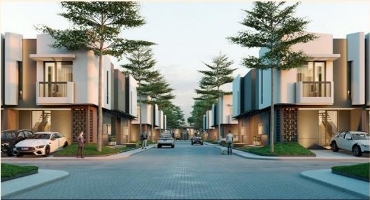
MAIN ROW 10 Meters